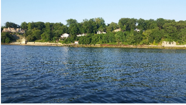
Figure 5 Hempstead Harbor Raft-up Location