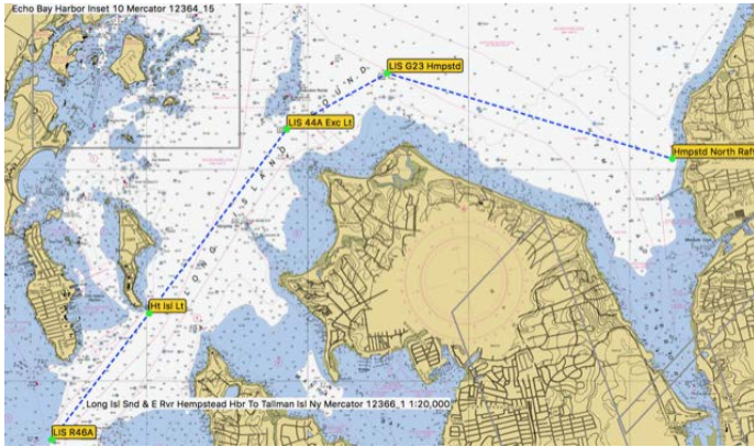
Figure 1 Hempstead Harbor Route Chart