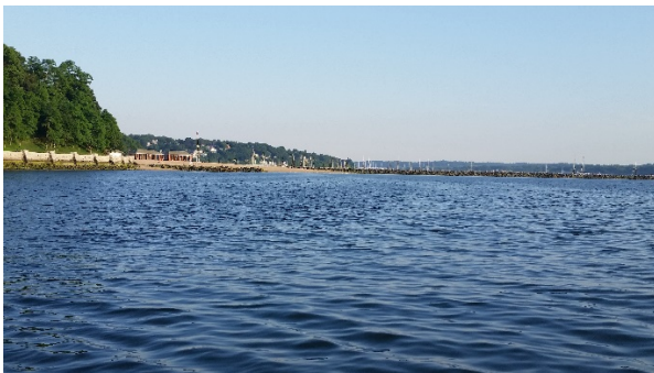
Figure 4 Hempstead Harbor Breakwater